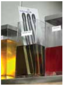
Chemical Resistance Test

clamped on substrate, which represents the enclosure door, at the end of the test.