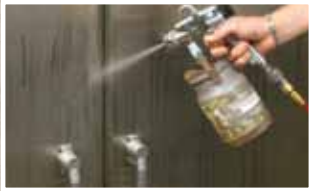
Type 12 Atomized Water Test