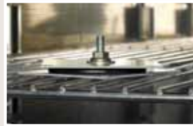
Blocking Adhesion Test

While proper adhesion is necessary for optimal gasket performance, blocking—defined as unwanted adhesion—could cause a gasket to stick to a sealing surface so that an operator cannot open an enclosure door. To test for blocking some manufacturers clamp a gasket to a substrate, which is compressed 50 percent with another substrate, and then soaked at 158°F for 24 hours. The objective is to not have any adhesion to the