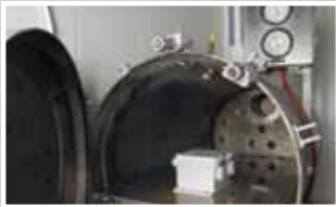
Type 6, 6P Water Submersion Test