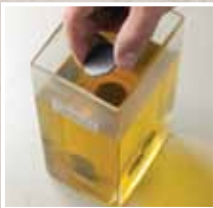
Type 12, 12K and 13 Oil Swell Test