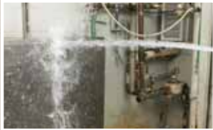
Type 4 Test