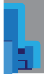
Tongue and Groove

Gasket effectiveness can additionally be designed into an enclosure to make it especially well suited for certain applications. For example, angled flange gaskets lead water away from the enclosure, protecting them from ingress in washdown applications, such as food and beverage, and pharmaceutical. Hidden gaskets and tongue-and-groove designs protect gaskets from physical damage, as well as UV and chemical exposure.