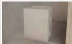
Cold Impact Test