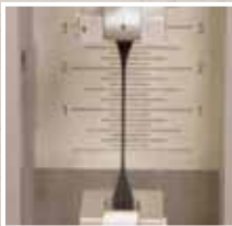
Tensile and Elongation Test