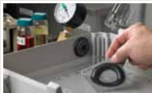
Water Absorption Test

In an optional cold impact test, the gasket material is subjected to -60°F (-51°C) for a minimum of 2 hours. Testers then strike the materials with a 16-ounce hammer and measure it to determine the compression, as well as any permanent impact points. Compression testing is not required by UL, but the American Society for Testing and Materials (ASTM) provides standards for performing this test and evaluating the results. The gasket material is first subjected to 158°F (70°C) for 3 days, and then gaskets are compressed at 20, 30, 40, 50 and 60 percent. Upon returning to room temperature, the compression set is checked. The gasket must return to within 10 percent of its original thickness to pass this test.