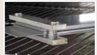
Compression Set Test